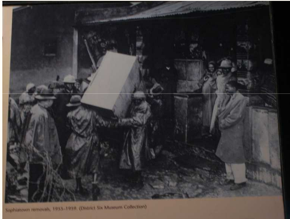
Sophiatown removals, 1955-1959.